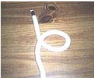
The rabbit hole.

Tying of the bowline, imagine the end of the rope as a rabbit, and where the knot will begin on the standing part, a tree trunk. First a loop is made near the end of the rope, which will act as the rabbit's hole. Then the "rabbit" comes up the hole, goes round the tree right to left, then back down the hole.