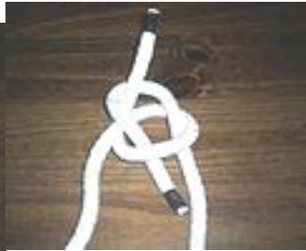
and hops back into hole