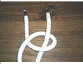
Out comes the rabbit,