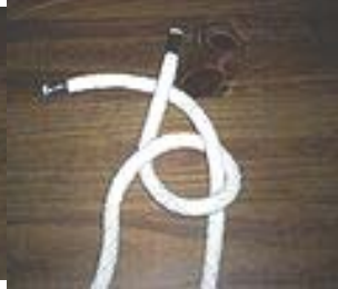
runs around the tree,